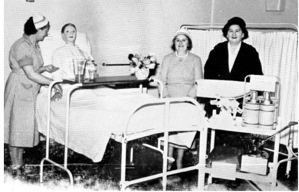
Donation of test doll by Ladies Auxiliary