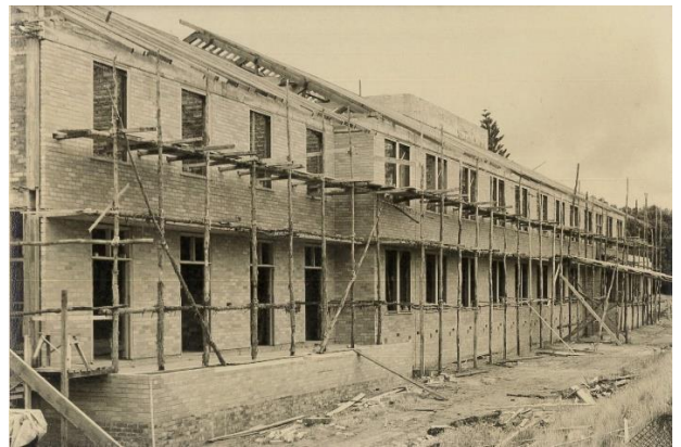
Hospital under construction