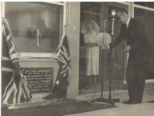
Photo: Official opening of Kerang and District Hospital His Excellency the Governor Sir Dallas Brooks