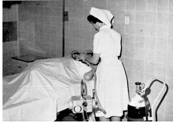
Bird Mk 8 Respirator in use