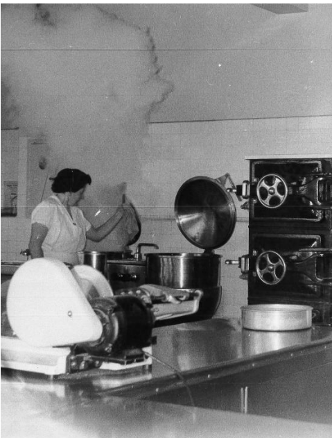
New kitchen in use