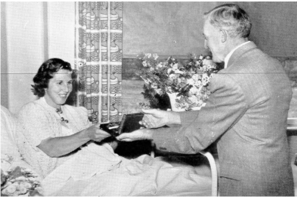
Gift to mother of 1000 th child delivered at Kerang and District Hospital