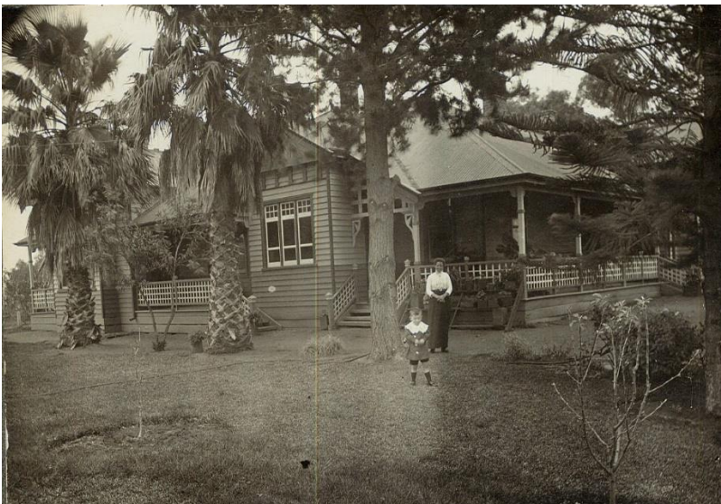
Photo: Allamatta (1911) House that was on the site where Glenarm was built in 1979

After the Second World War, the Bush Nursing Hospital was unsuitable for a modern surgery and became overcrowded. In 1946, a public appeal was launched, resulting in the hard work of many to raise money for a new hospital. The Bush Nursing Hospital was purchased by the Baptist Church and became "Northaven", a guest home for the elderly.