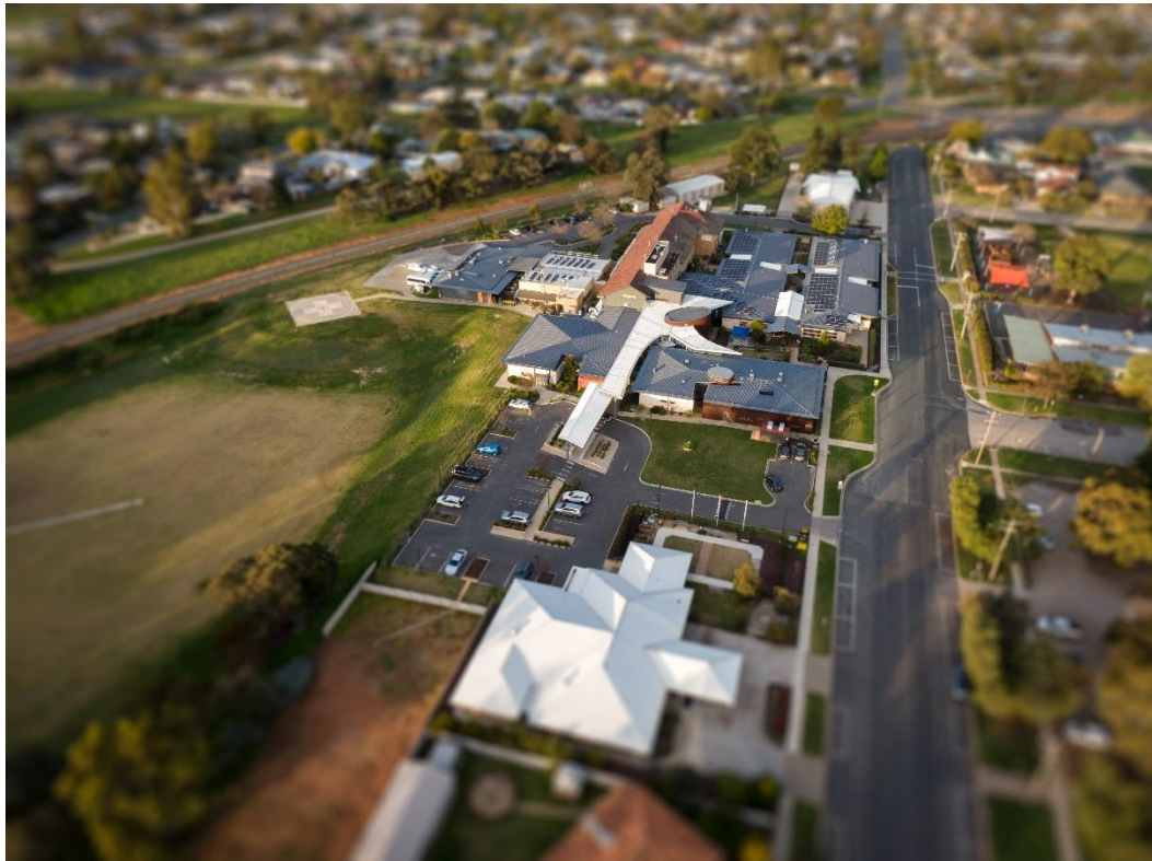
Kerang District Health now (2024)